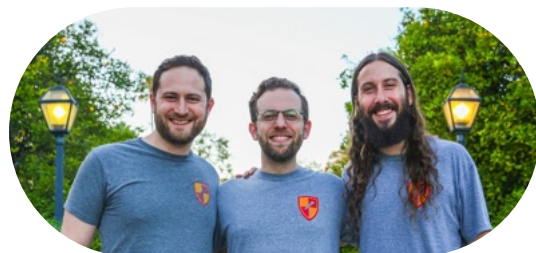
to our most recent session in 2023