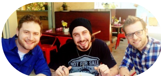
from our first planning meeting in 2012

The mission of A Cappella Academy is to use contemporary a cappella music as a vehicle to train exemplary young musicians from all national, ethnic, and socioeconomic backgrounds and instill the importance of community. We accomplish this through our programs, including our summer session for young singers, a training program for music educators, and a year-round choir based in Los Angeles. We also facilitate regular community events aimed at giving singers of all ages a chance to connect, hone their skills, and feel the joy of group singing.