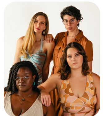
Red Letter Daze vocal group